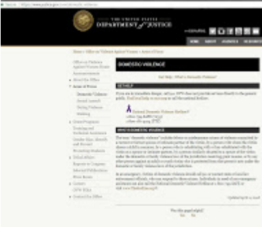
domestic violence.JPG 141K

Psychological Abuse: Elements of psychological abuse include - but are not limited to - causing fear by intimidation; threatening physical harm to self, partner, children, or partner's family or friends; destruction of pets and property; and forcing isolation from family, friends, or school and/or work .